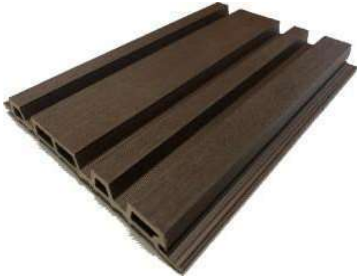
SUAVE PROFILE DESIGN

A design that is both Beautiful & Practical